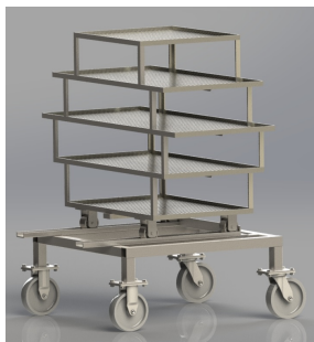
Rack and Cart